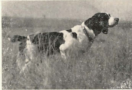
Gringo de Britt OFA Certified

Home of Amateur and Fld. Ch. Gringo de Britt