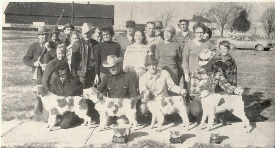
The four winners (l. to r.) and a portion of the gallery