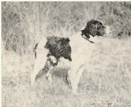
Fld. Ch. Juchoir Chocolate Candy