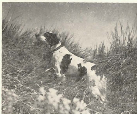
Dual Ch. Skipper of Siouxland