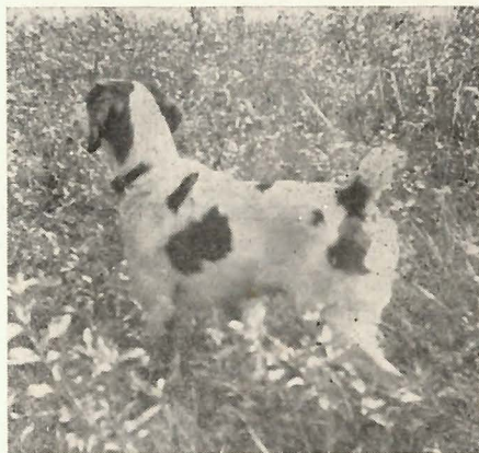
Fld. Ch. The Circuit Contender

Epilepsy is the most common cause of fits in dogs. (Referred to are fits that are not associated with other illnesses). Those who have delved into the subject believe that this epilepsy is hereditary, inherited as a Mendelian recessive. This would mean that two dogs could be carriers of epilepsy without having fits themselves. When mated a number of the progeny would be epileptics and would have fits. There have been several reports of Brittanies recently being epileptics.