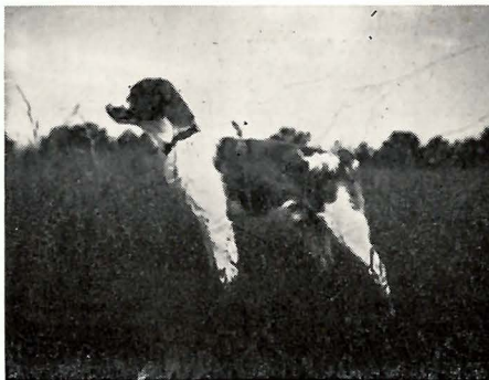
COPPER CREEK BOBB