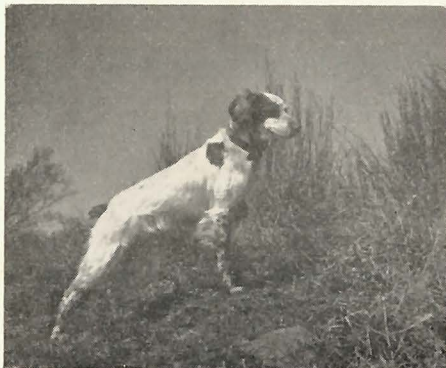
Dual Ch. Mar-Ko Valkerie