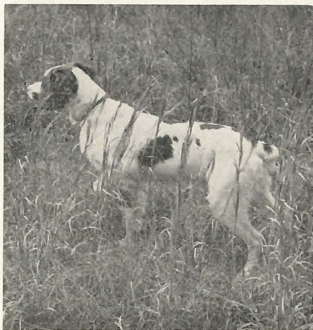
Fld. Ch. Augustus of Rivers