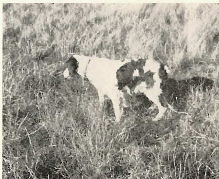
Fld. Ch. Boy's Little Rex