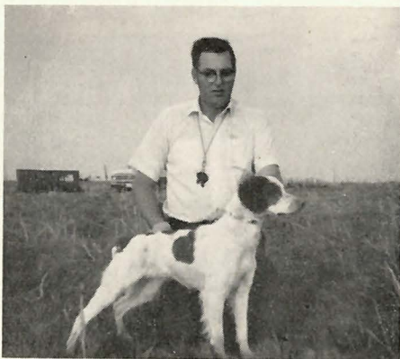
Jill the Pill