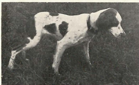
Ja-Dee's Peppermint Patty places Second in the Derby Stake

A few cars stuck in the mud and a little rain never held things back as everyone helped make this an enjoyable week-end at the Pennsylvania Brittany Club.