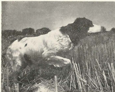
Fld. Ch. Duke's Spike