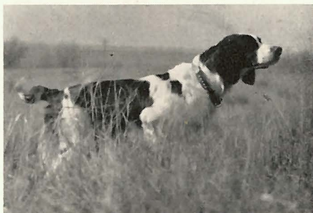
Gringo de Britt OFA Certified

Home of Amateur and Fld. Ch. Gringo de Britt