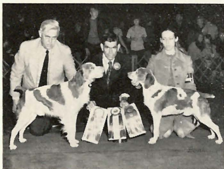
Barry the Fierce & Mok Deuce the Fierce