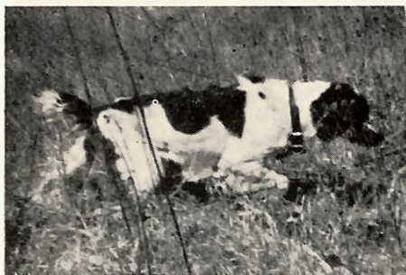
Fld. Ch. Paul of Leeway's Red