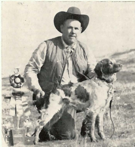
Brandy's Pacolet Sam

4—Tate's Wee Lad O'Bonny Doon, by Ch. Marco Polo ex Reine DuVallon