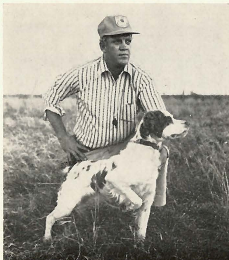
Speed Dusty Wind