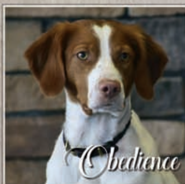
CH Keill's Goldstar Kir Royale CD BN RE JH AX AXJ OF "Kir" o: Sue Drazek